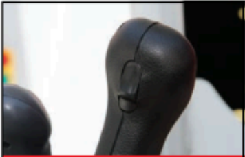
2-Speed Travel w/ Auto Shift