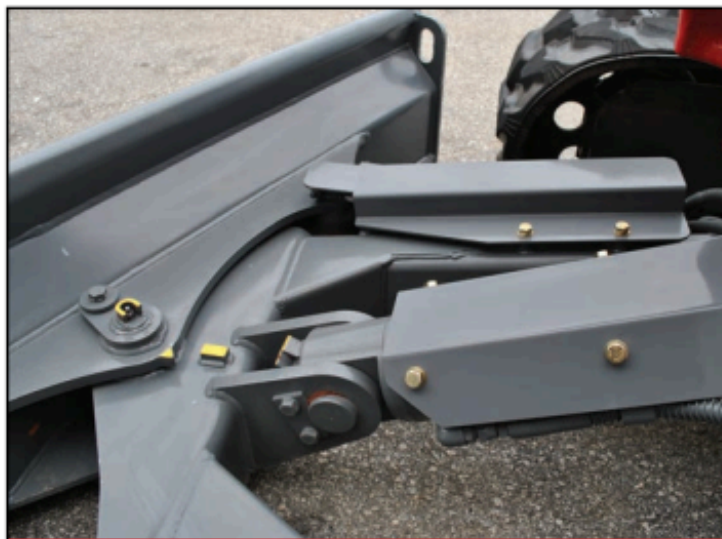
Angle Blade with Reversible Bolt On Cutting Edge