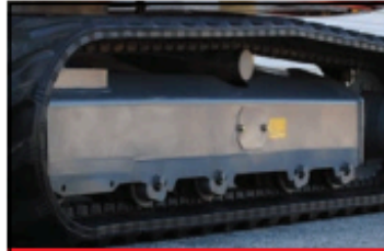
Triple Flanged Track Rollers