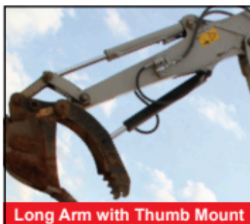
Long Arm with Thumb Mount