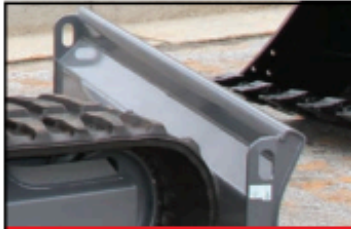
Integrated Anchor Points