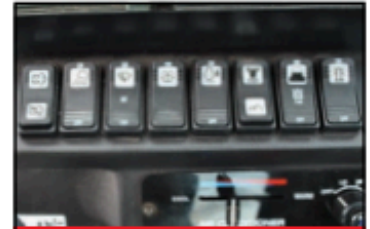
Multi-Function Switch Bank

Delivering outstanding performance and versatility, the TB240 is one of Takeuchi's most popular conventional tail swing excavators. The TB240 offers steel construction and lockable service access panels, an automotive styled interior, and a smooth and powerful hydraulic system. The TB240 has excellent breakout force, reach and lifting capacity for maximum productivity making it a great choice for the most demanding applications.