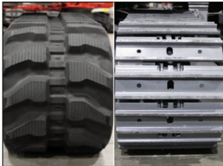
Track Options - Rubber or Steel