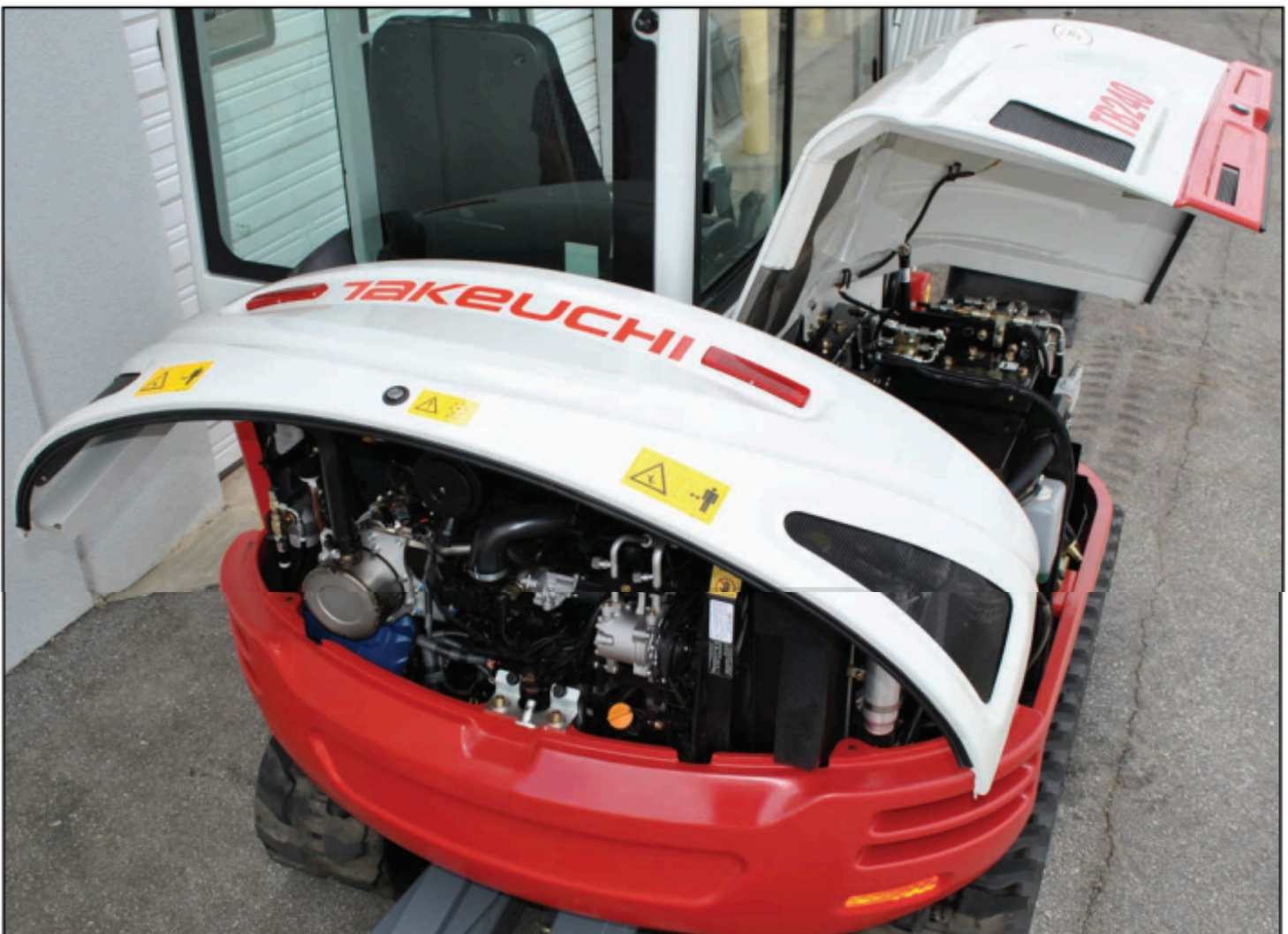
Large lockable service hoods provide vandalism protection and outstanding maintenance access.

Additional features include a DOC + DPF exhaust after treatment system, automatic idle, heavy duty cooling module, and a large wraparound counterweight that protects engine components from damage. The interior offers excellent operator comfort with pilot operated controls, travel controls with large foot pedals, foot operated boom swing, easy to reach rocker switches and a dial throttle control.